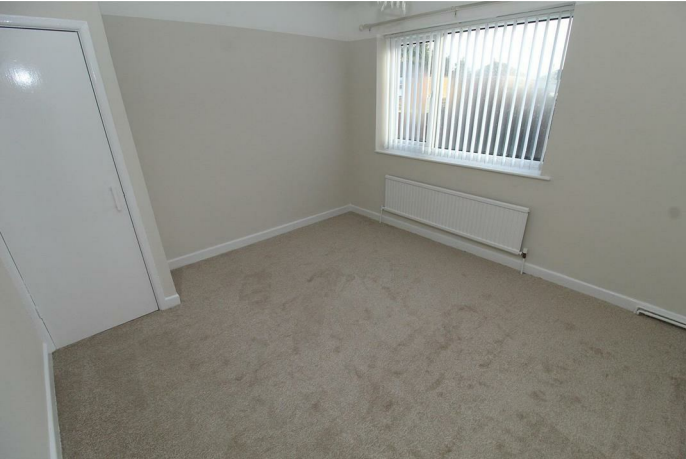
uPVC double glazed window to rear aspect, radiator, built in cupboard