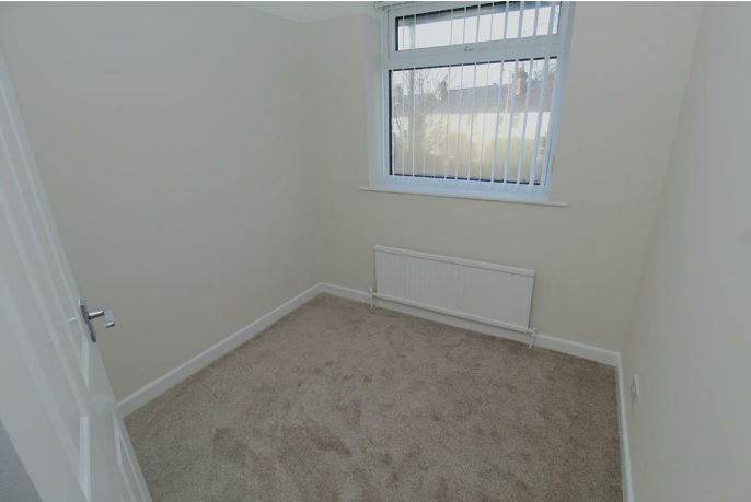
uPVC double glazed window to front aspect, radiator