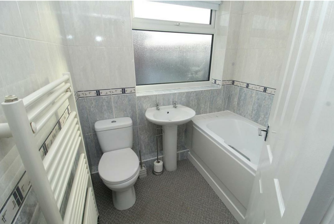
white suite comprising; panelled bath with mains shower over, wash hand basin and low level w.c., white heated towel rail, tiled walls, uPVC double glazed frosted window to rear aspect