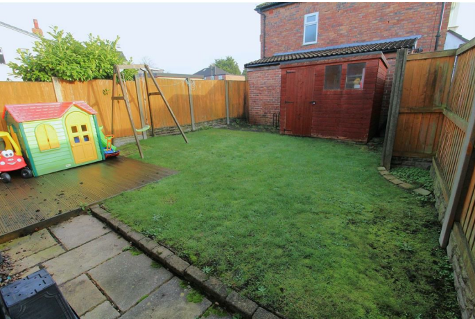
timber deck and lawn, gated access to front